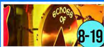
Echoes of Pompeii PINK FLOYD TRIBUTE ECHOESOF POMPEII.COM