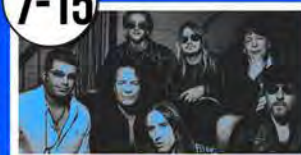
Double Vision THE ULTIMATE FOREIGNER EXPERIENCE DOUBLEVISIONBAND.COM