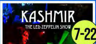
Kashmir CHICAGO'S LED ZEPPELIN SHOW KASHMIRCHICAGO.COM