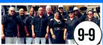
Heavy SPECIALIZING MOTOWN, R&B, LATIN, & SOFT ROCK THEBANDHEAVY.ORG

SAVE THE DATE PINTS IN THE 8/21 PARK 5-9PM