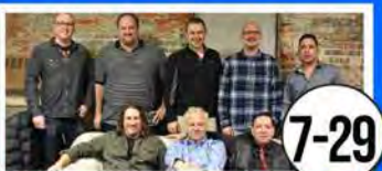
MegaBeatles A TRIBUTE TO THE MUSIC OF THE BEATLES FACEBOOK.COM/MEGABEATLES