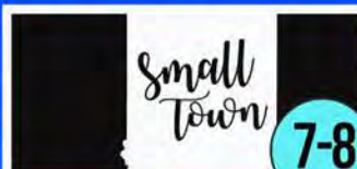
Small Town A JOHN MELLENCAMP EXPERIENCE FACEBOOK.COM/SMALL.TOWN.BAND.INDIANA