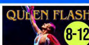
Queen Flash A TRIBUTE TO THE MUSIC QUEEN QUEENFLASH.CA