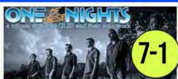
One of These Nights A TRIBUTE TO THE EAGLES ONEOFTHESENIGHTSBAND.COM