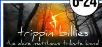
Trippin Billies DAVE MATTHEWS TRIBUTE TRIPPINBILLIES.COM