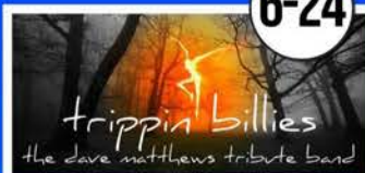
Trippin Billies DAVE MATTHEWS TRIBUTE TRIPPINBILLIES.COM