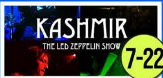
Kashmir CHICAGO'S LED ZEPPELIN SHOW KASHMIRCHICAGO.COM