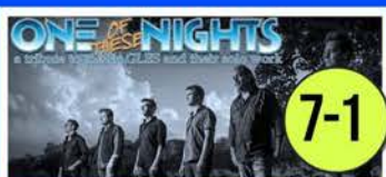
One of These Nights A TRIBUTE TO THE EAGLES ONEOFTHESENIGHTSBAND.COM