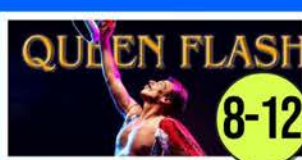
Queen Flash A TRIBUTE TO THE MUSIC QUEEN QUEENFLASH.CA