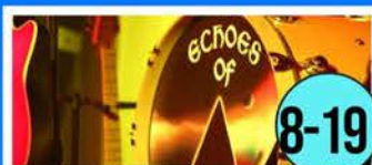
Echoes of Pompeii PINK FLOYD TRIBUTE ECHOESOF POMPEII.COM