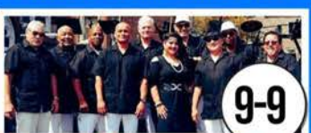
Heavy SPECIALIZING MOTOWN, R&B, LATIN, & SOFT ROCK THEBANDHEAVY.ORG

SAVE THE DATE PINTS IN THE 8/21 PARK 5-9PM