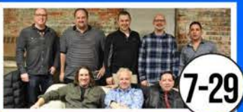
MegaBeatles A TRIBUTE TO THE MUSIC OF THE BEATLES FACEBOOK.COM/MEGABEATLES