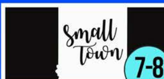
Small Town A JOHN MELLENCAMP EXPERIENCE FACEBOOK.COM/SMALL.TOWN.BAND.INDIANA