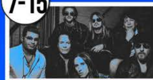
Double Vision THE ULTIMATE FOREIGNER EXPERIENCE DOUBLEVISIONBAND.COM