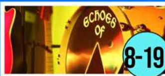
Echoes of Pompeii PINK FLOYD TRIBUTE ECHOESOF POMPEII.COM