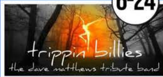
Trippin Billies DAVE MATTHEWS TRIBUTE TRIPPINBILLIES.COM