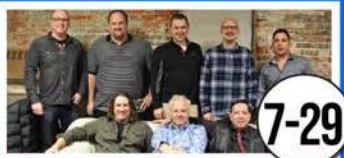
MegaBeatles A TRIBUTE TO THE MUSIC OF THE BEATLES FACEBOOK.COM/MEGABEATLES