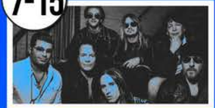
Double Vision THE ULTIMATE FOREIGNER EXPERIENCE DOUBLEVISIONBAND.COM