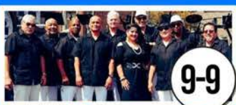
Heavy SPECIALIZING MOTOWN, R&B, LATIN, & SOFT ROCK THEBANDHEAVY.ORG

SAVE THE DATE PINTS IN THE 8/21 PARK 5-9PM