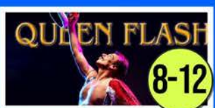
Queen Flash A TRIBUTE TO THE MUSIC QUEEN QUEENFLASH.CA