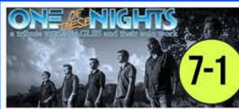
One of These Nights A TRIBUTE TO THE EAGLES ONEOFTHESENIGHTSBAND.COM